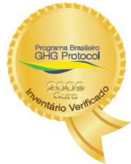
Gold: Verified by third party